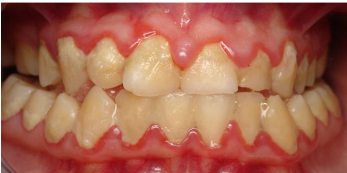
Bleeding and swollen gums